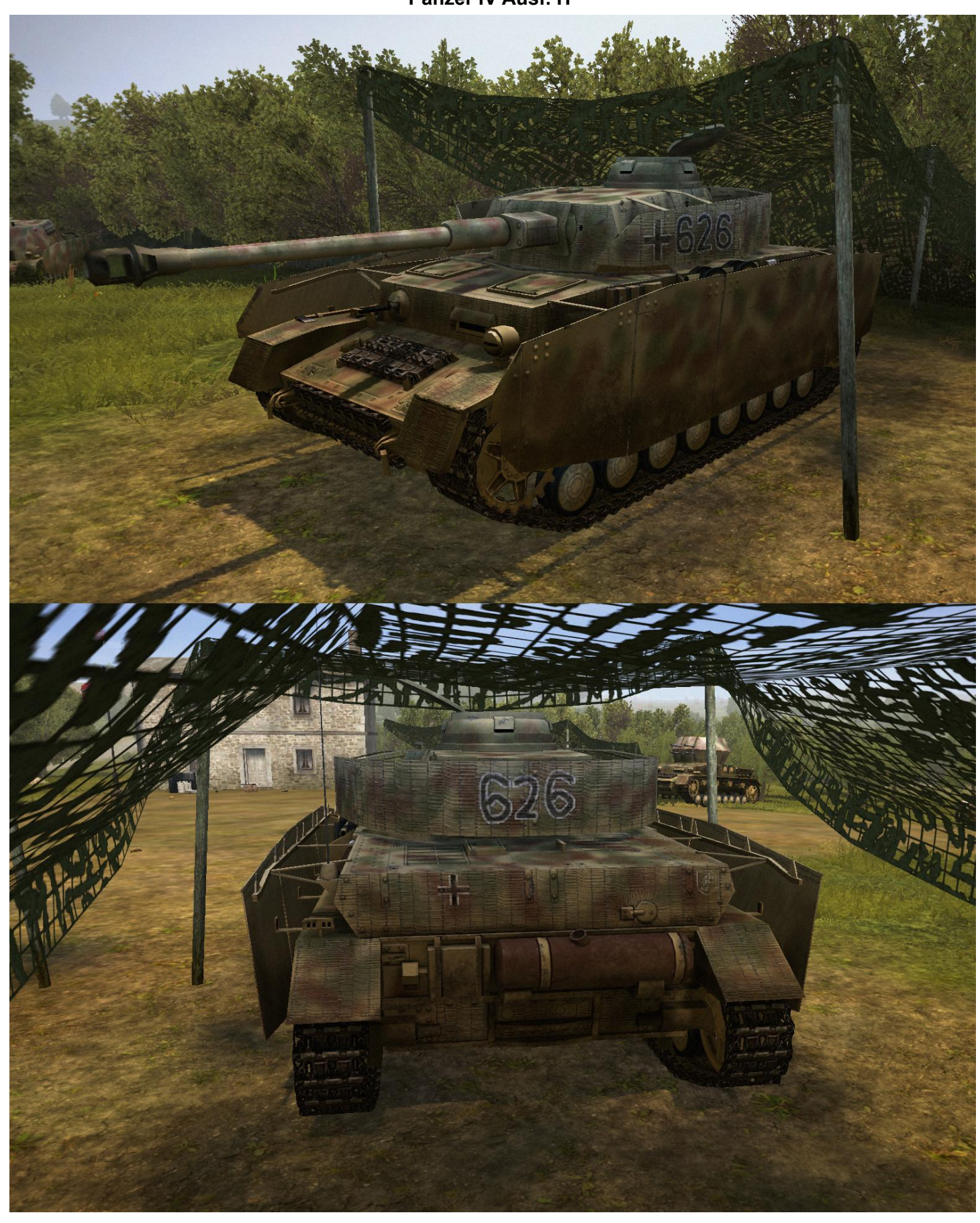
Panzer IV Ausf. H