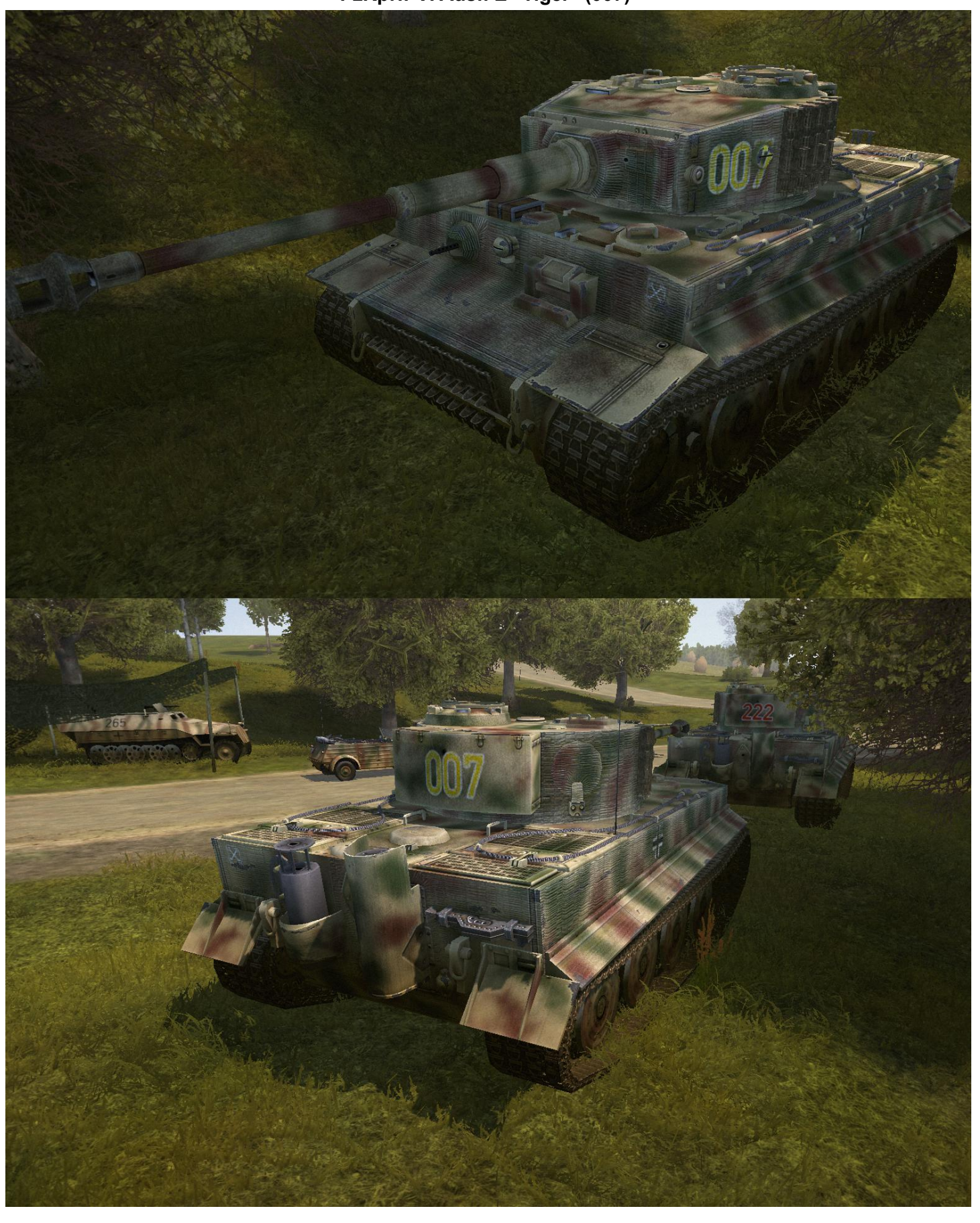
PzKpfw VI Ausf. E "Tiger" (007)