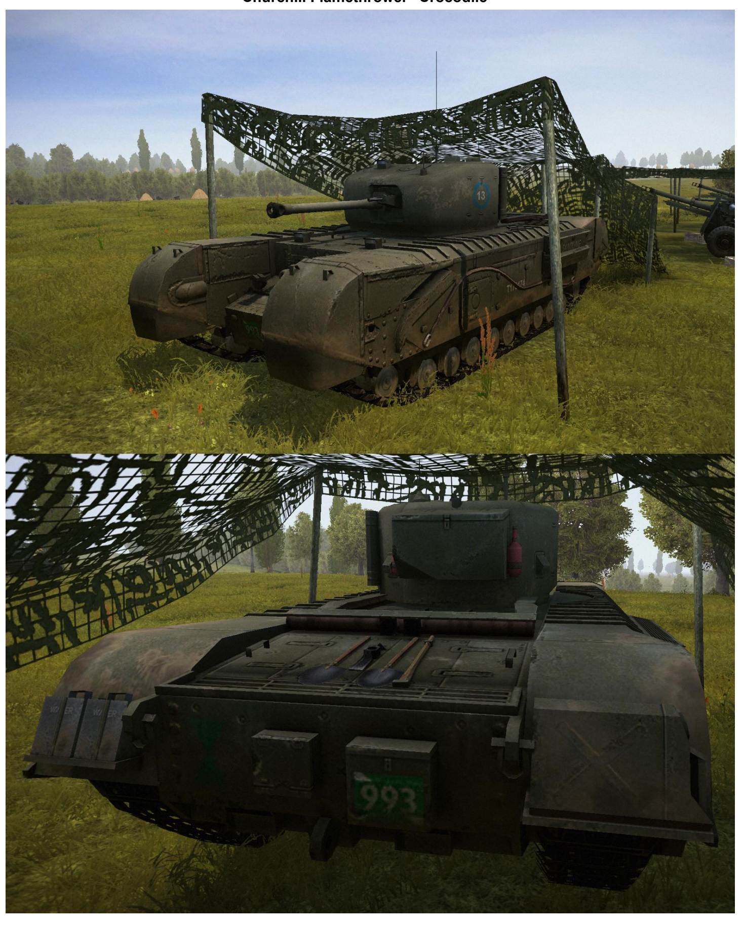
Churchill Flamethrower "Crocodile"