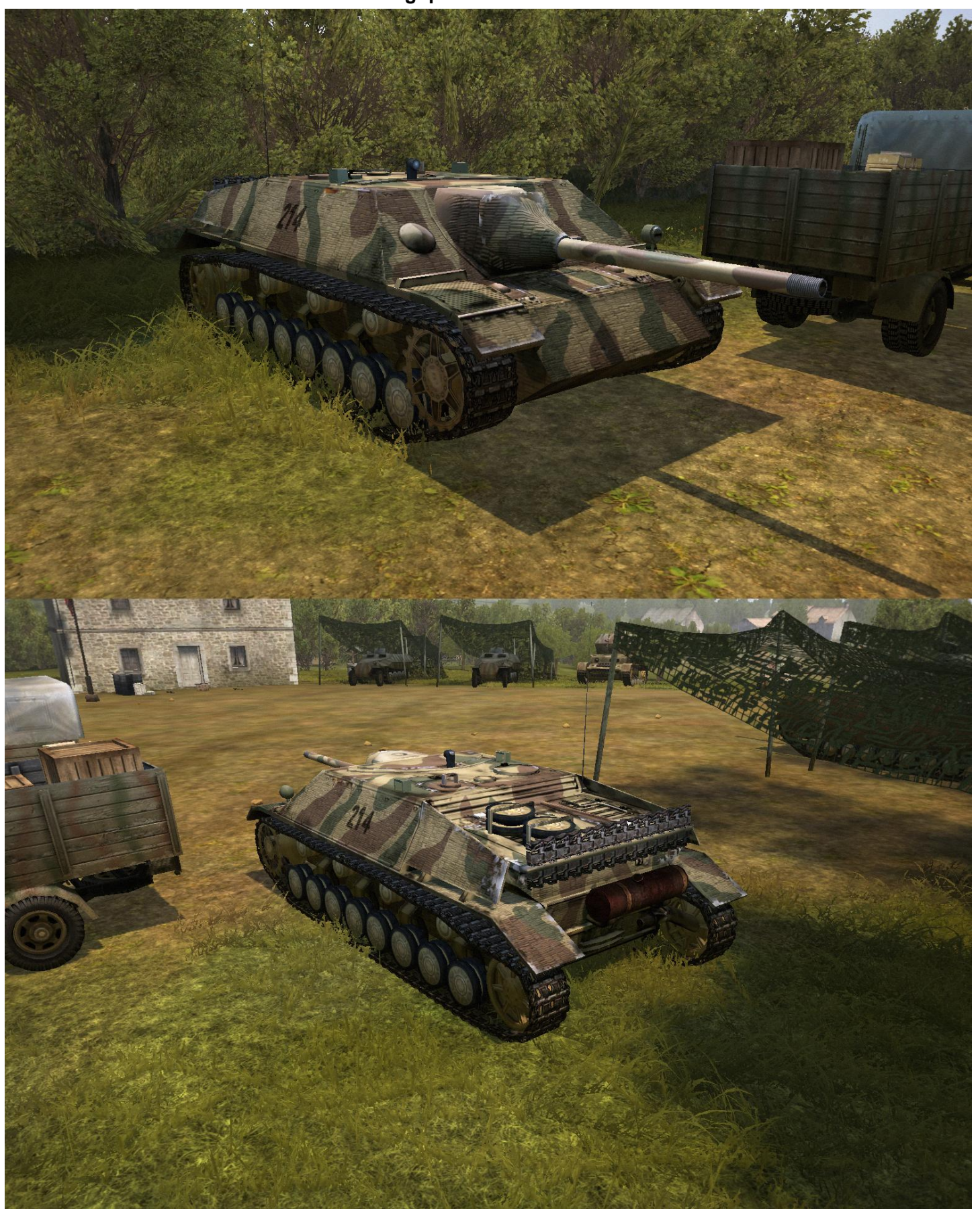
Jagdpanzer IV Ausf. F