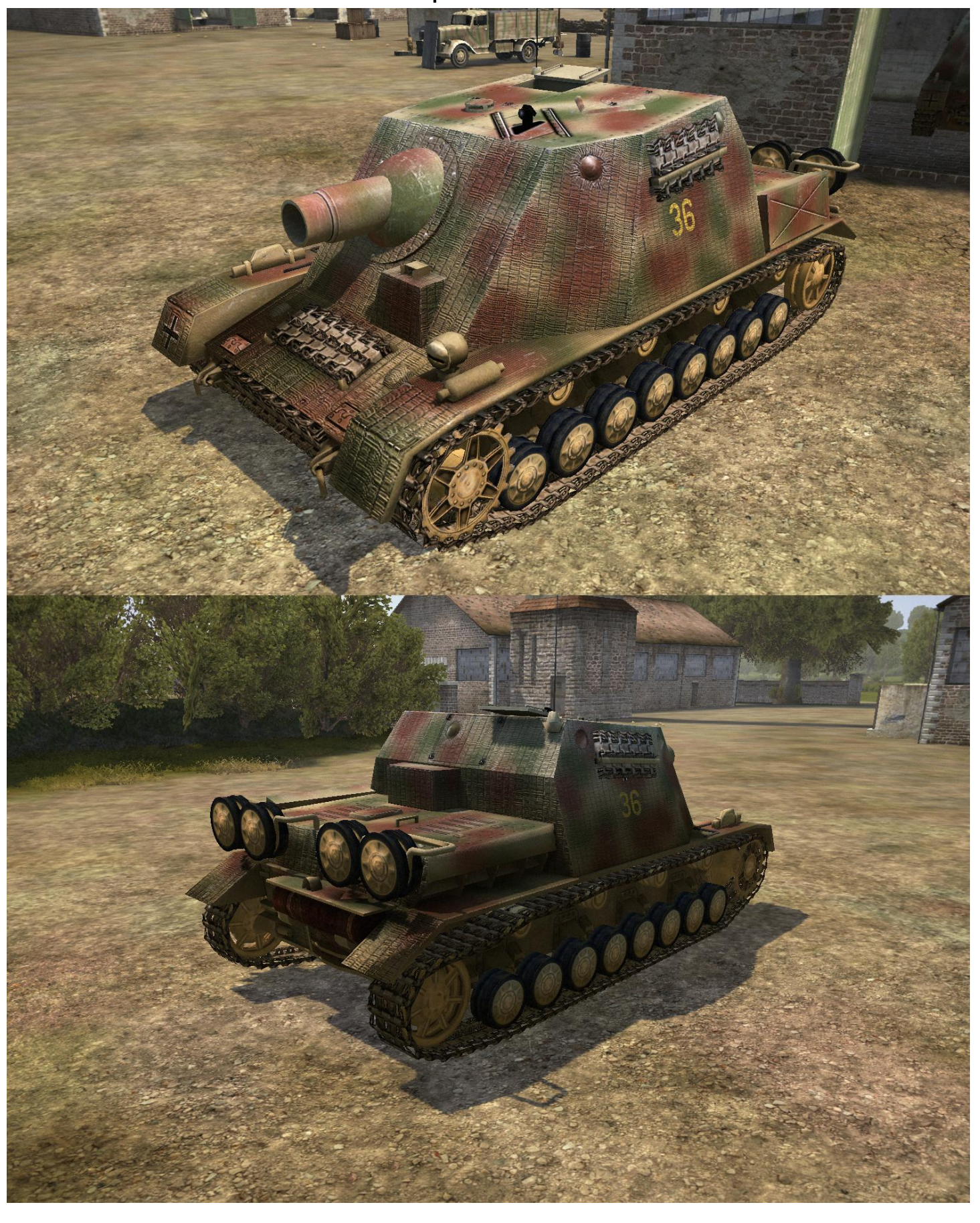
Sturmpanzer IV Ausf. III